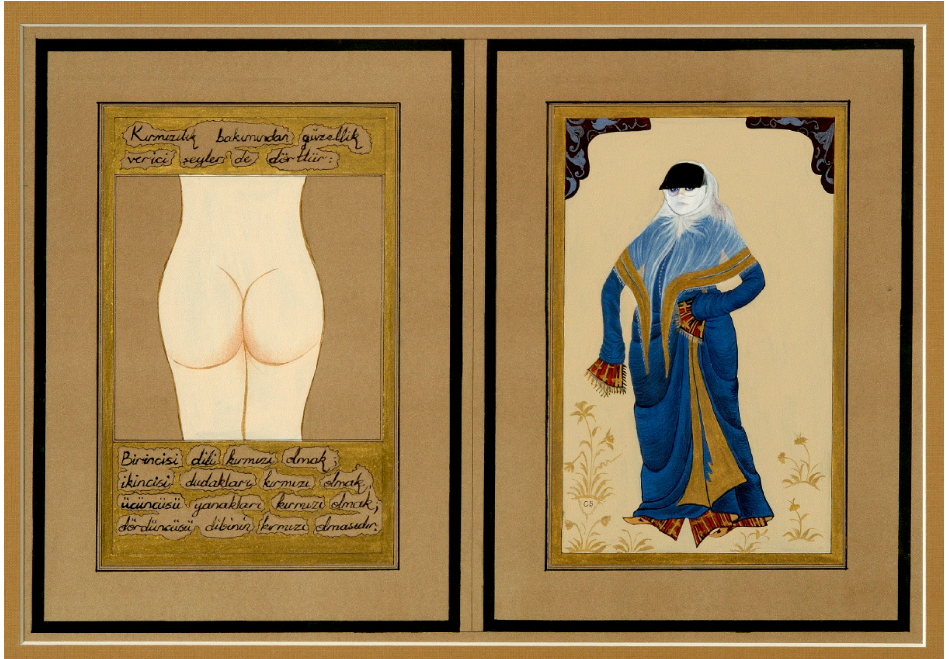
Kusursuz Güzellik Serisi - Kırmızılık / Perfect Beauty Series - Redness aherli kağıt üzerine karışık teknik / mixed media on special paper, 35 x 50 cm, 2009