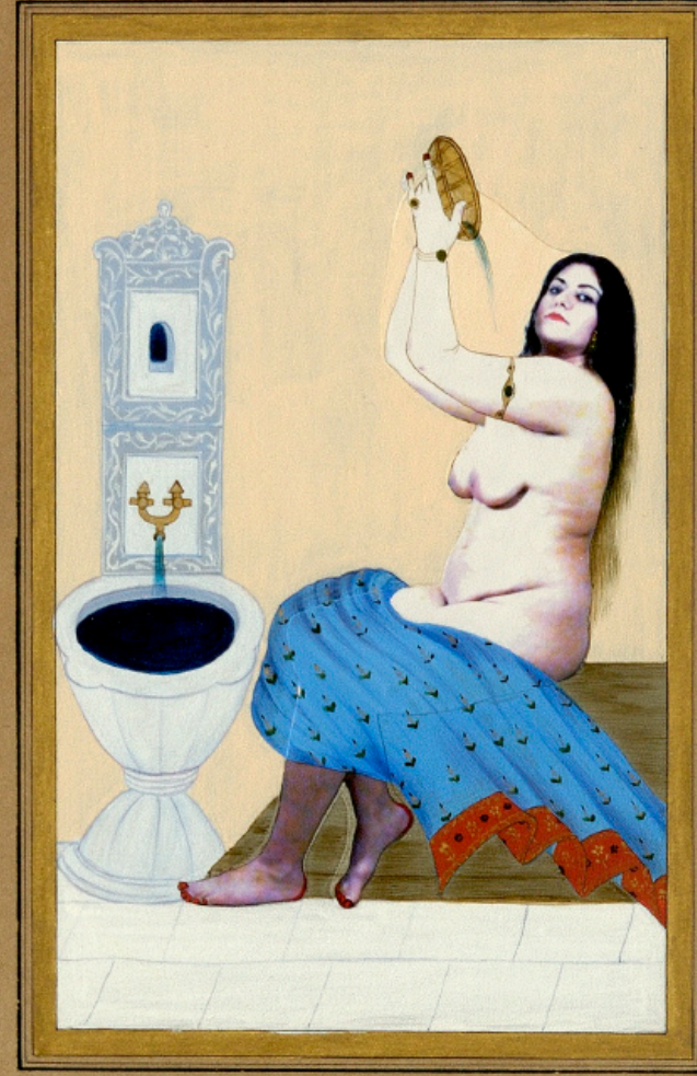
Kusursuz Güzellik Serisi - Sıklık / Perfect Beauty Series - Tightness aherli kağıt üzerine karışık teknik / mixed media on special paper, 35 x 50 cm, 2009