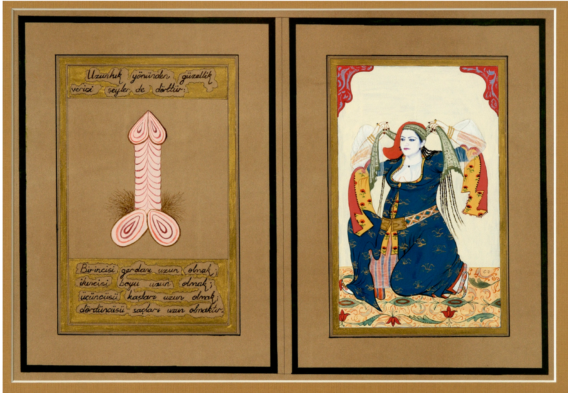
Kusursuz Güzellik Serisi - Uzunluk / Perfect Beauty Series - Length aherli kağıt üzerine karışık teknik / mixed media on special paper, 35 x 50 cm, 2009